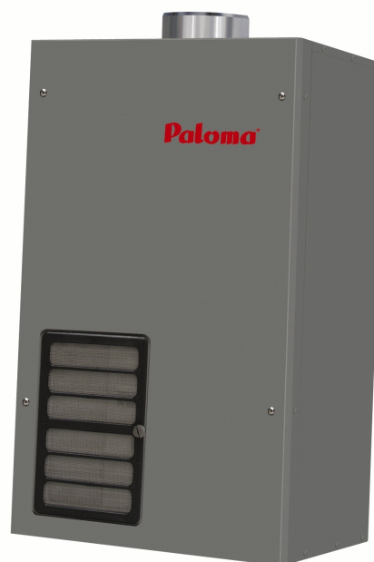
Figure 1. A typical on-demand water heater (Paloma Waiwela PH28CIFS).